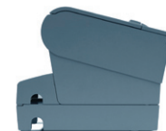
Power supply case fits under printer without increasing footprint size.